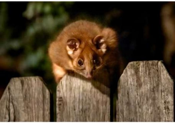
An image of a ringtail Possum - one of many Australian wildlife species