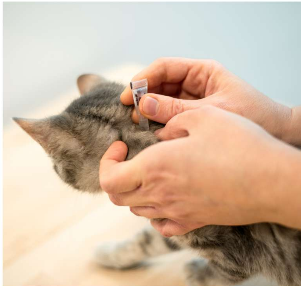
A pet owner applying a topical flea treatment

The newly emerged adult flea begins to feed almost immediately ( 0 to 60 seconds ) after jumping onto an available host.